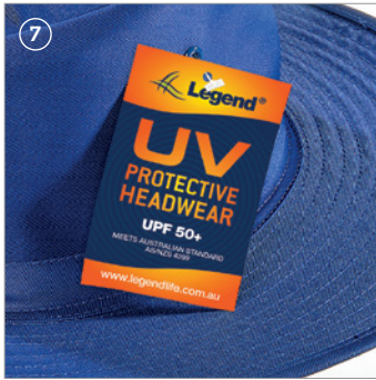
UV protection information label attached

No slouching in this hat – smart, tough and meets all Australian standards for sun protection. Available in 53cm, 55cm, 57cm, 59cm and 61cm sizes.